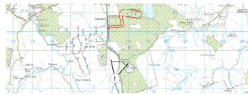
Viewpoint 1 (3.47 km): View from A9 memorial. Photomontage and wireline of the proposed Loch Toftingall Wind Farm. Photomontage photography taken from Grid Reference 317327, 948533 set up with a 53.5 degree field of view.