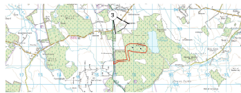
Viewpoint 3 (2.06 km): View from A9 at Spittal. Photomontage and wireline of the proposed Loch Toftingall Wind Farm. Photomontage photography taken from Grid Reference 316885, 953713 set up with a 53.5 degree field of view.